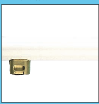
LINEAR S14s T30 WH