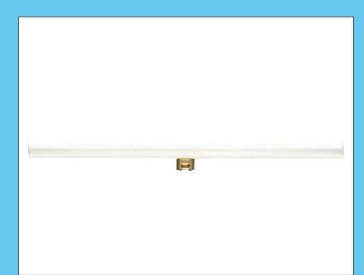
LINEAR S14d T30 WH